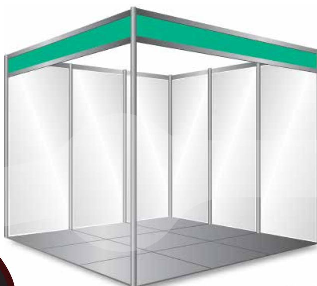
(Diagram is an example only)